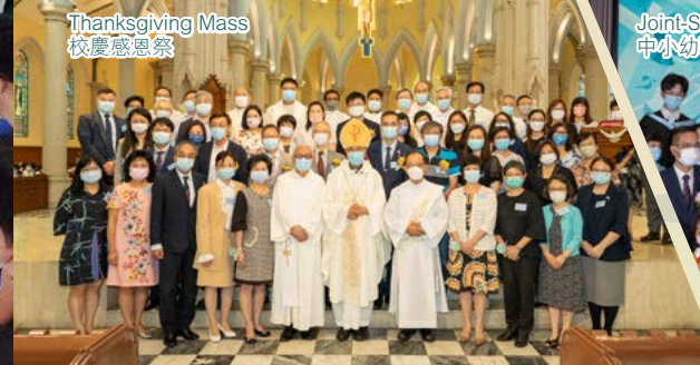
Thanksgiving Mass 校慶感恩祭