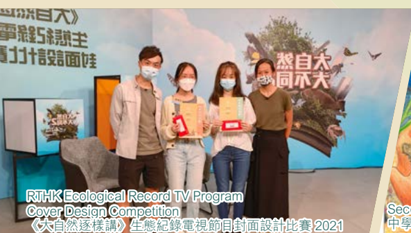
RTHK Ecological Record TV Program Cover Design Competition 《大自然逐樣講》生態紀錄電視節目封面設計比賽 2021