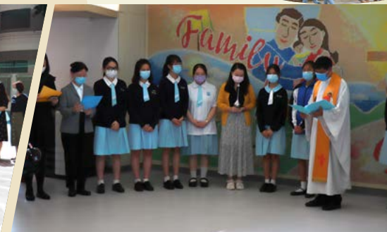
Joint-Section Graduation Ceremony 中小幼聯合畢業典禮