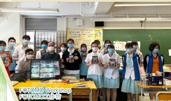
FOTOMO Workshop FOTOMO工作坊