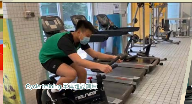
Cycle training 單車體能訓練