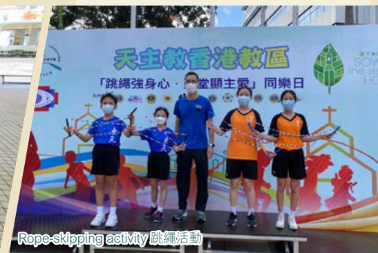
Rope-skipping activity 跳繩活動