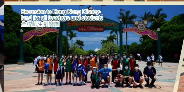
Excursion to Hong Kong Disneyland for all teachers and students 全校師生到樂園