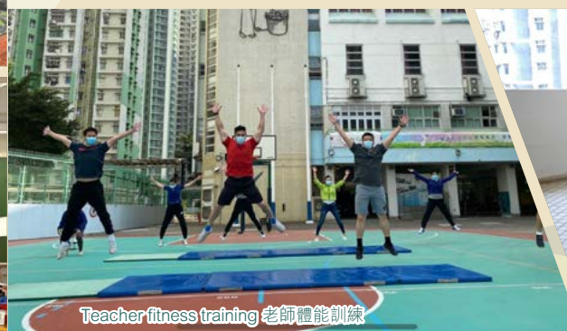
Teacher fitness training 老師體能訓練