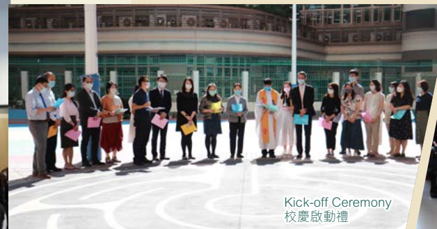
Kick-off Ceremony 校慶啟動禮