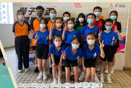
Rope Skipping Competition 全港跳繩比賽