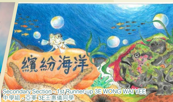
Secondary Section - 1st Runner-up 3E WONG WAI YEE 中學組 - 亞軍 3E王惠儀同學