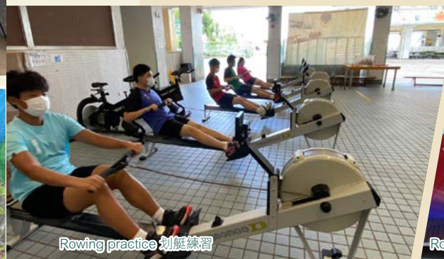
Rowing practice 划艇練習

為了讓學生了解健康生活的重要，本校一直鼓勵學生參與運動，並成立不同的運動校隊讓學生參與。例如男、女子籃球隊、田徑隊、越野隊、游泳隊、划艇隊、足球隊、跳繩等等。