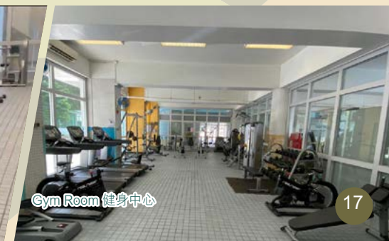
Gym Room 健身中心