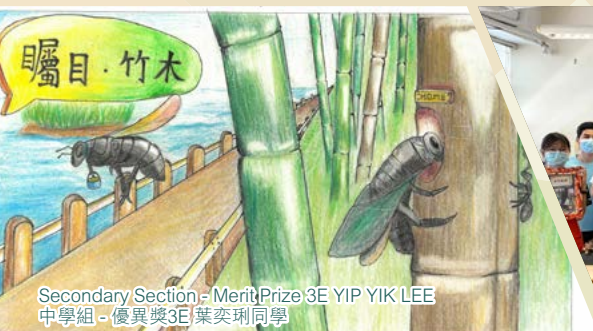
Secondary Section - Merit Prize 3E YIP YIK LEE 中學組 - 優異獎 3E 葉奕莉同學