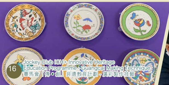
Jockey Club ICH+ Innovative Heritage Education Programme - Guangcai Making Technique 賽馬會「傳·創」非遺教育計劃 - 廣彩製作技藝