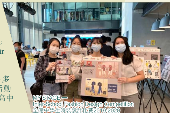
MY STAGE— Inter-School Fashion Design Competition 全港中學生時裝設計比賽2019-2020

本校致力培養學生創作，校園裡有很多學生的藝術作品。在正規課程和聯課活動中，學生可盡情發揮美術和音樂潛力，高中時更可選讀視覺藝術科和音樂科。